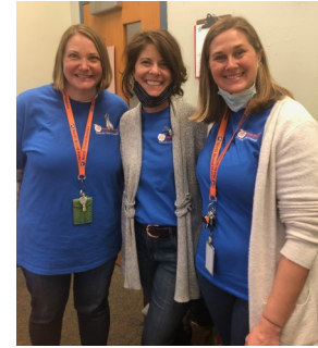
North Broad Elementary