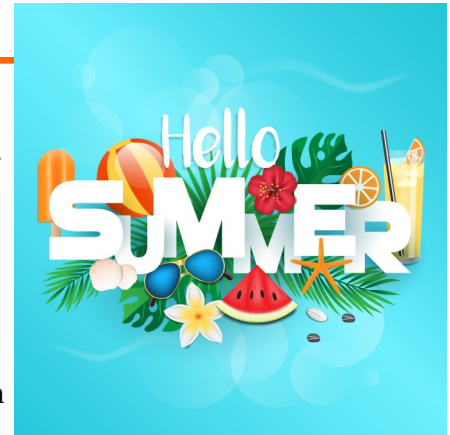
Table of Cotents: