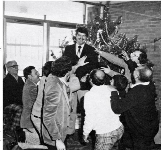
The members of the Social Studies Department of Oneida High School